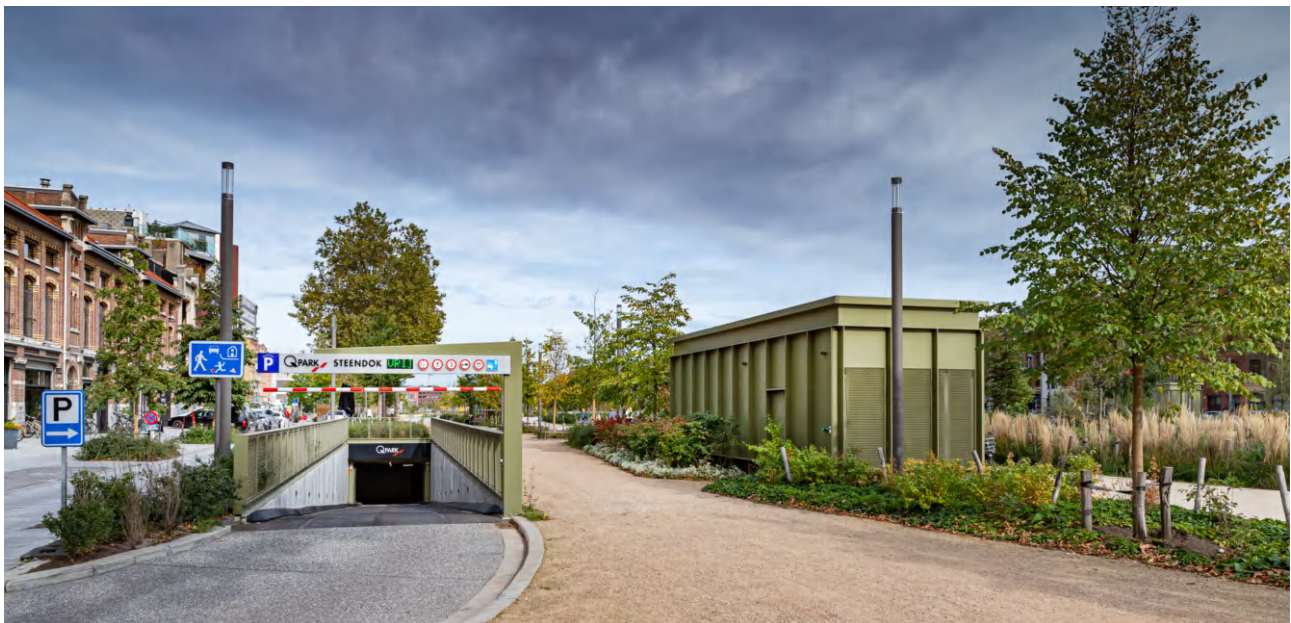
People above ground - cars and bicycles under ground