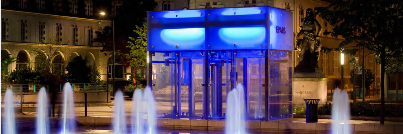
Modern technology in historic city centre - Q-Park Coeur de ville in Chartres, France

We set ourselves apart by our continual focus on making a positive contribution to urban life, to optimising the role played by parking in the mobility chain, and to making the parking experience a pleasurable one.