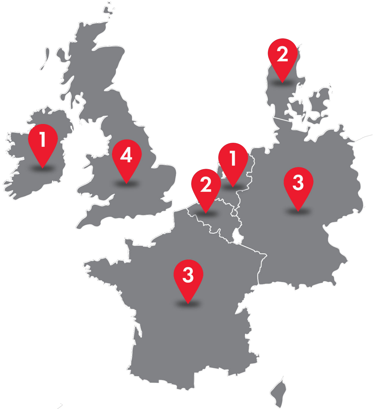
Q-Park's market position across seven West European countries.