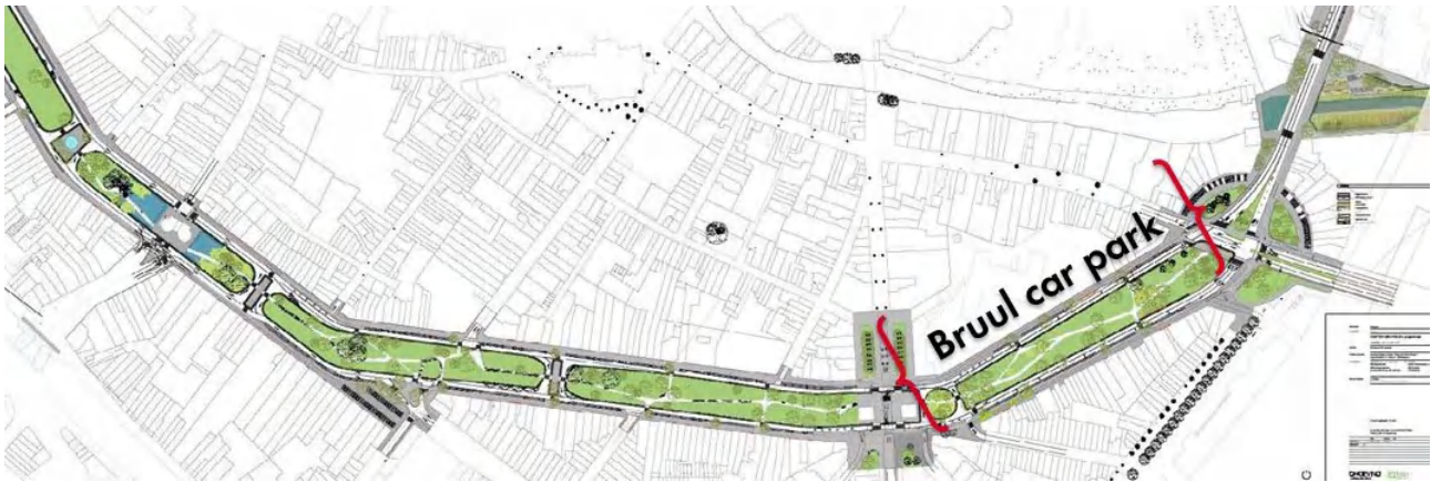
Future of parking; underground parking at the inner ring road with an attractive green recreational park on top.

A strong sense of corporate social responsibility (CSR) is embedded in everything that Q-Park does as a company. It underpins every major management decision, every new project, and every engagement we have with our community of users. It's part of our Quintessence, which is how we bring together all of our ideas about regulated and paid parking, and about how we work with our partners and stakeholders to contribute to the quality of life in our cities.