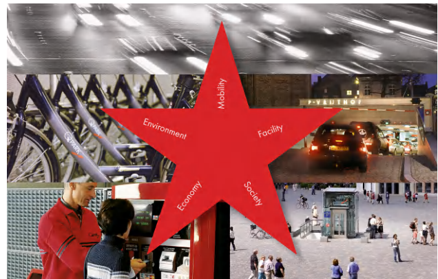
Quintessence - The logic of regulated and paid parking

Our Quintessence is to guide those who are interested along the way of understanding 'the logic of regulated and paid parking'. As a mnemonic, Quintessence is illustrated as a five point guiding star, where each point in itself is a good reason to regulate or pay for parking.