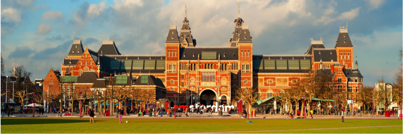
People above ground - cars and coaches below ground