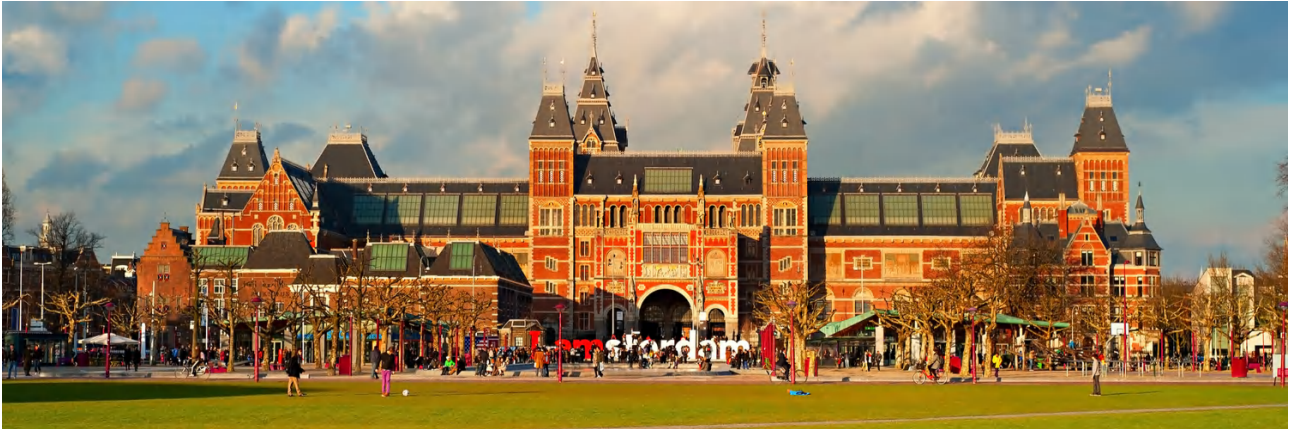
People above ground - cars and coaches below ground